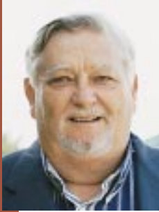
Nissan Rand Seniors Cmtee Chairman