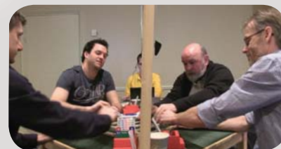
Faites vos Jeux

https://www.youtube.com/watch?v=qImN2wcmHVM