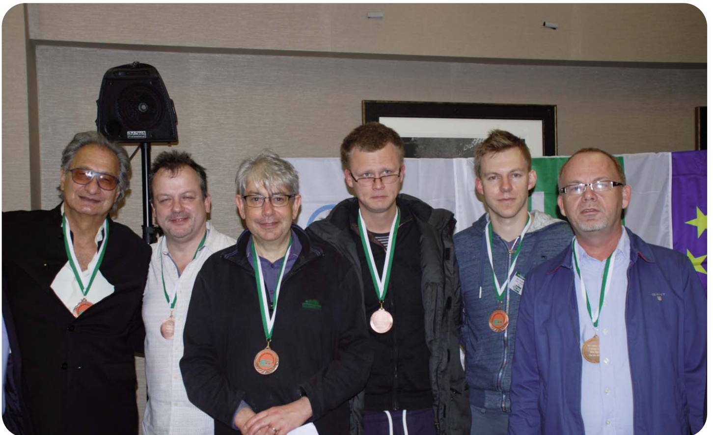
Team EBU - Bronze Medal