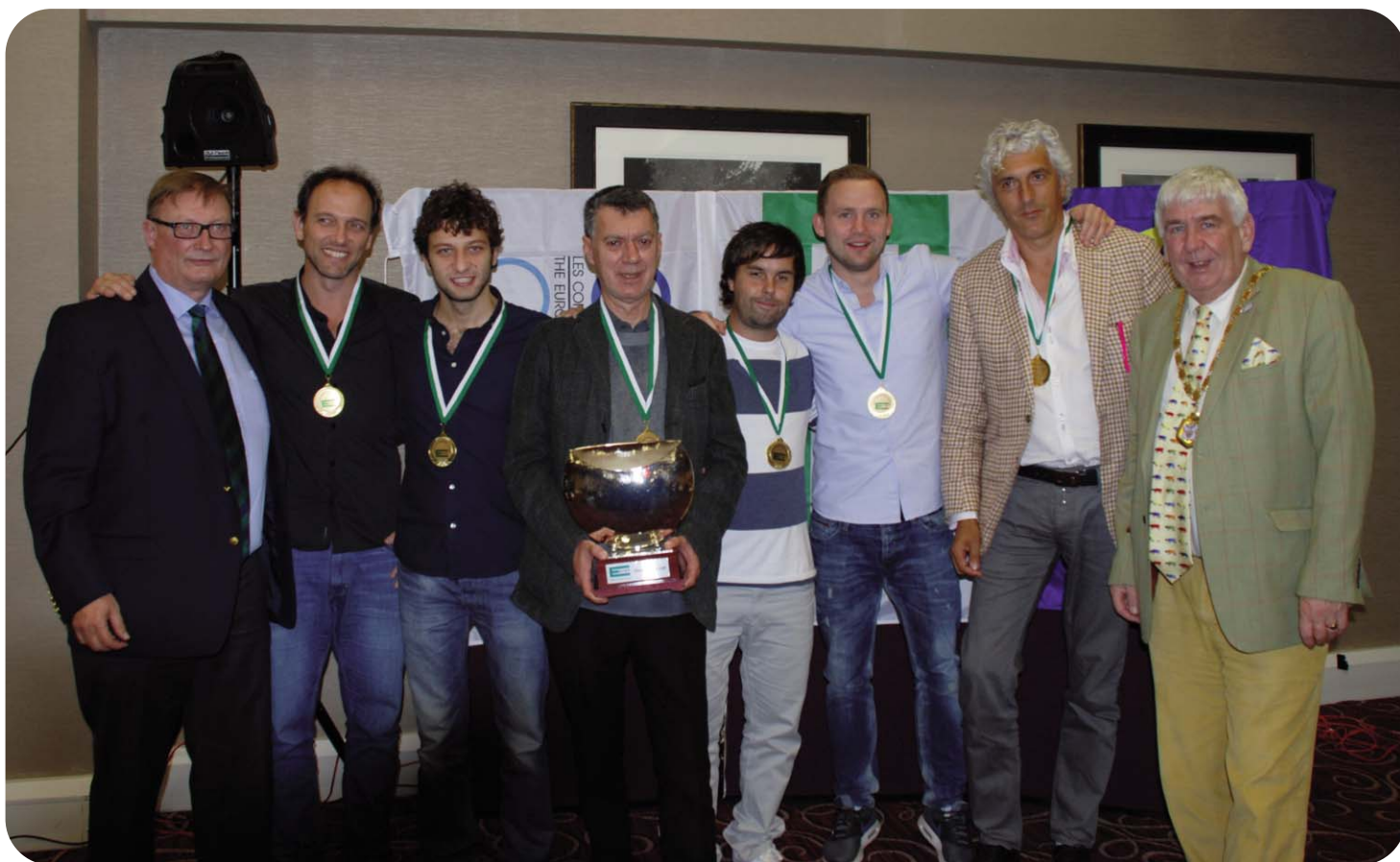
Team Allegra - Gold medal.