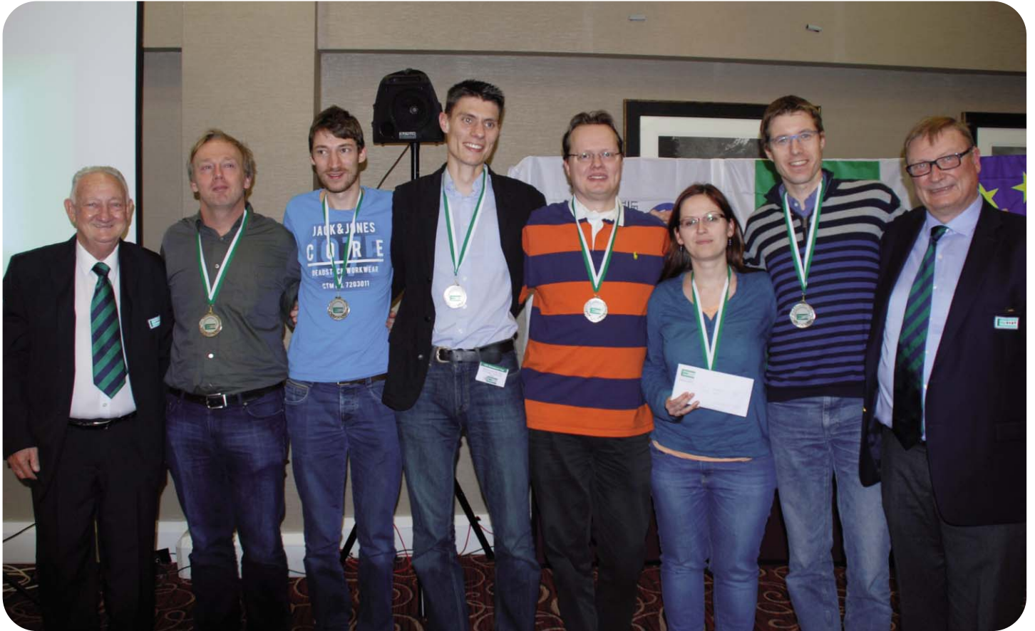
Team BC'T Onstein - Silver Medal