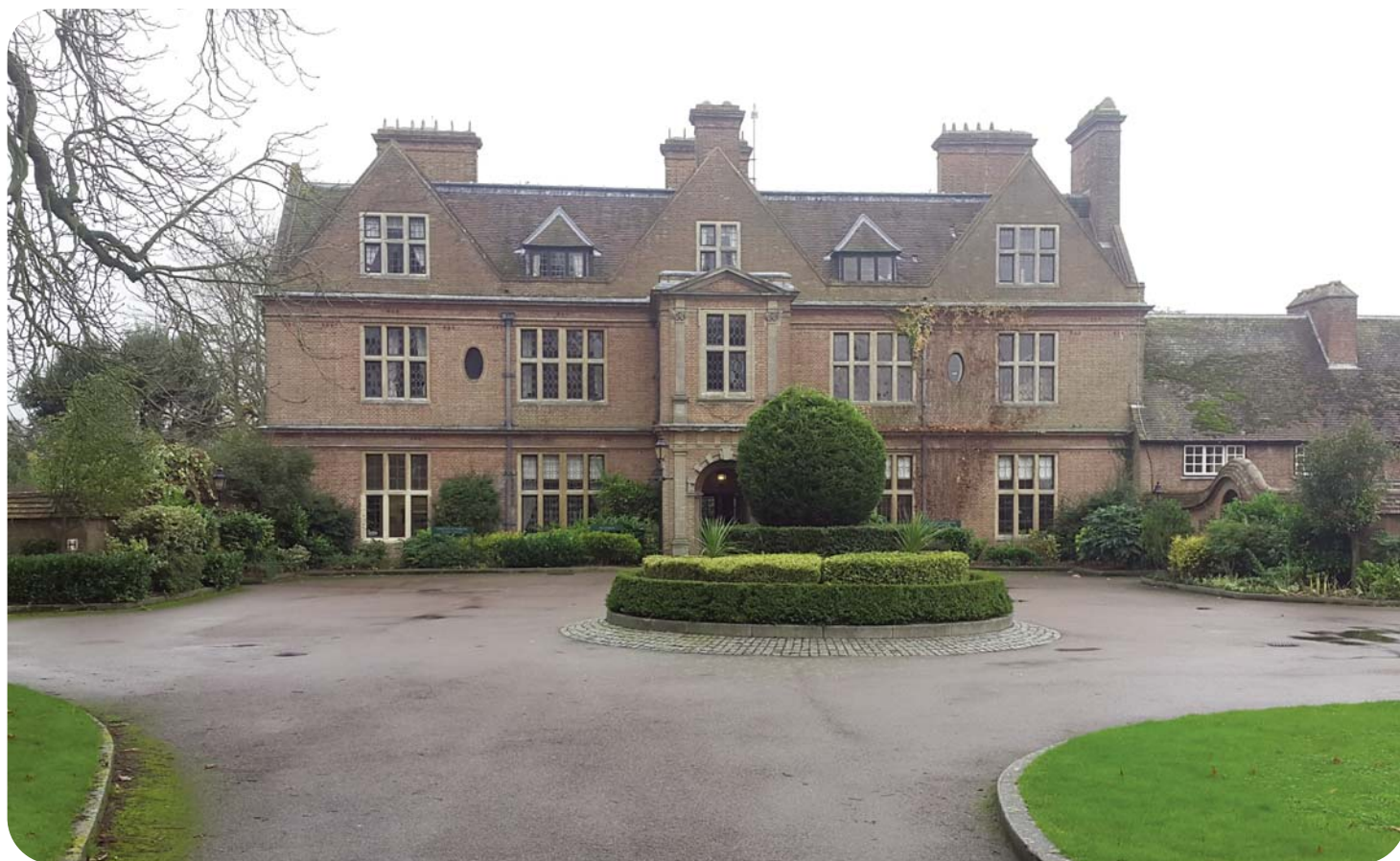
Our impressive looking venue - the Horwood House Hotel

The qualifying round robin was completed on Friday evening and we are now at the serious end of the tournament, where one loss is the end, with each of the three groups of four teams (1-4, 5-8 and 9-12) playing 32-board semi-finals and finals on Saturday to decide the 2015 champions and the rest of the overall rankings.