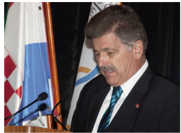
Ivo Dujmić Mayor of the City of Opatija