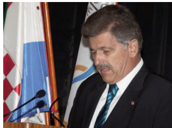
Ivo Dujmić Mayor of the City of Opatija