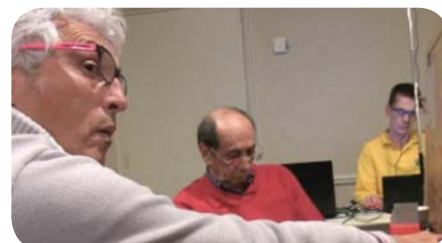
Next Step: KO

https://www.youtube.com/watch?v=FloYw6SAjvk