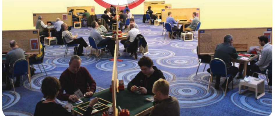
The comfortable playing room