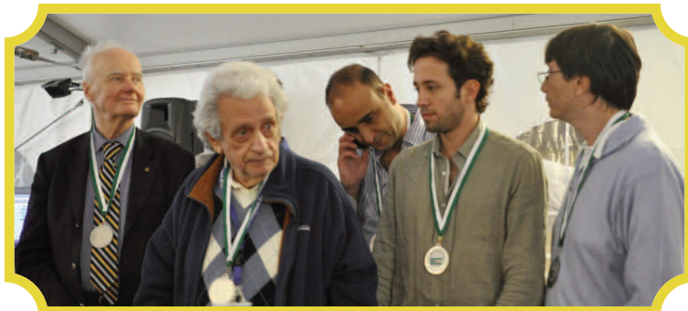
Silver goes to team Breno.