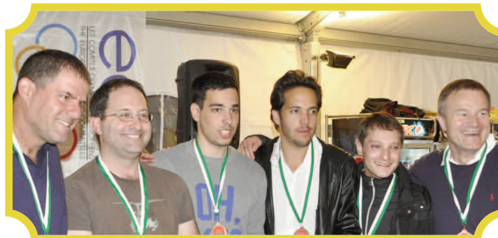
Team Isrmany comes third.