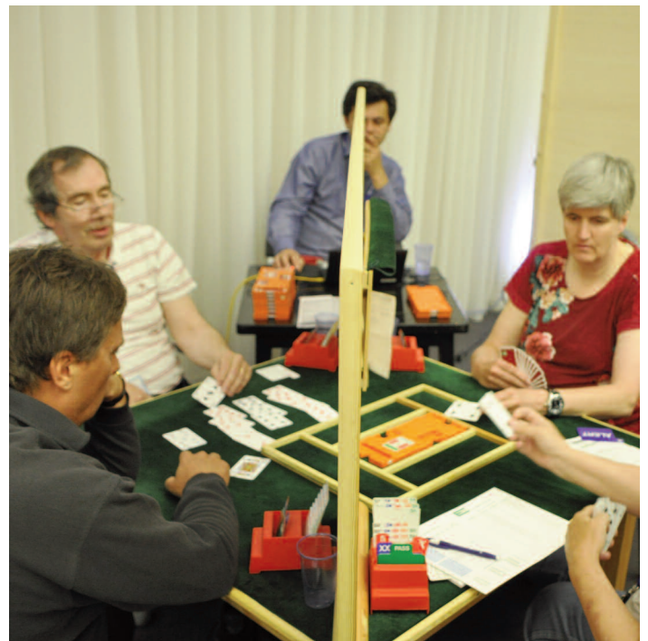
Barel - Vriend, Closed Room