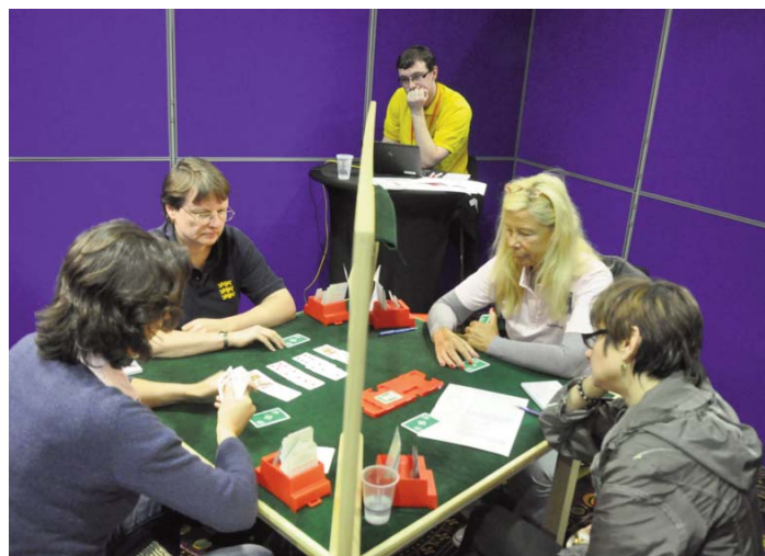
In the BBO cubicle in the closed room