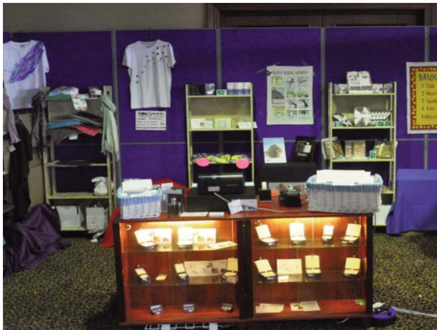
The championship souvenirs are located on the first floor

Meanwhile the Seniors are starting to arrive in readiness for the start of their event on Saturday.